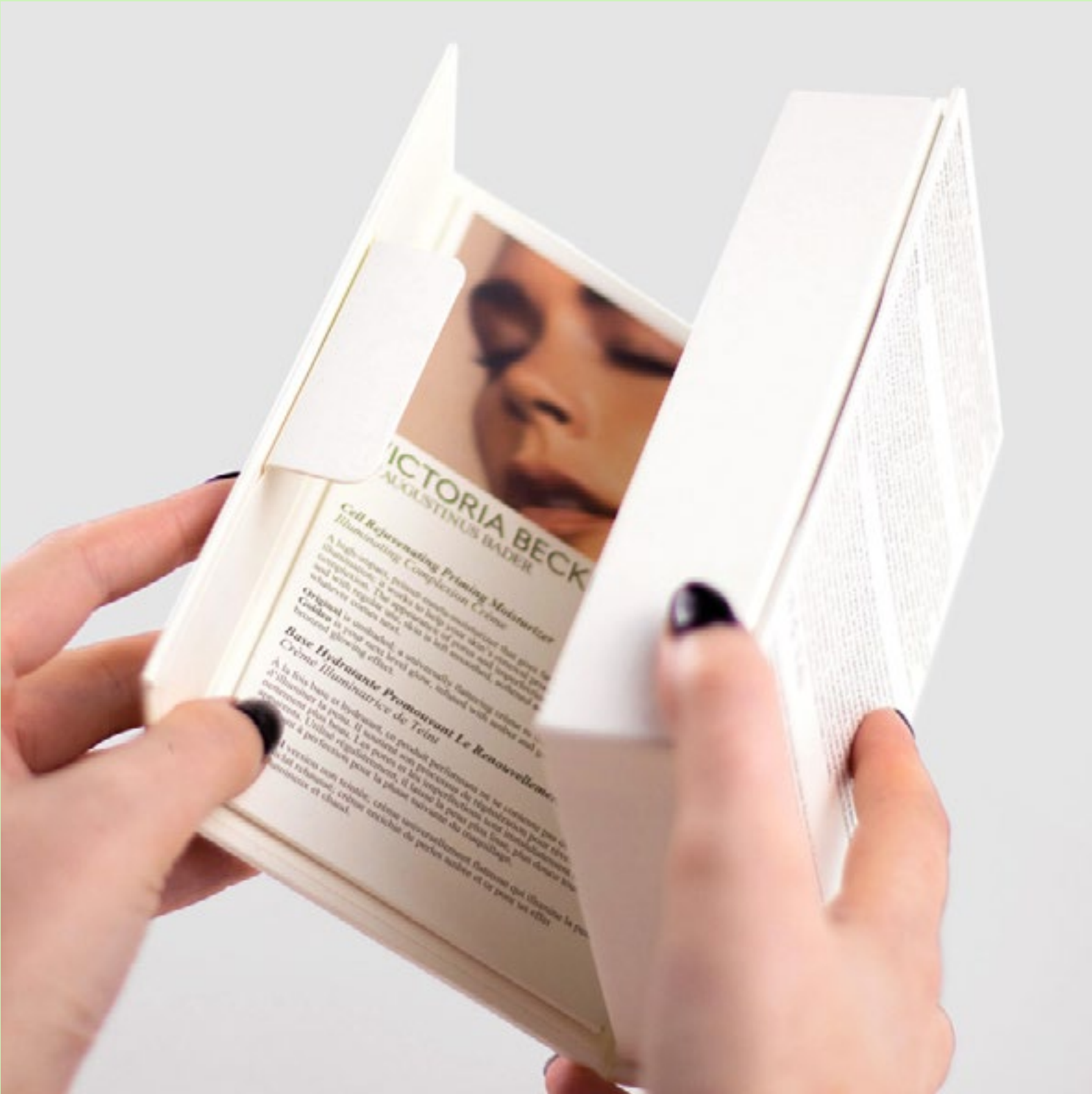
Card tuck-in closure replacing the use of magnets, to ensure the pack was fully recyclable.