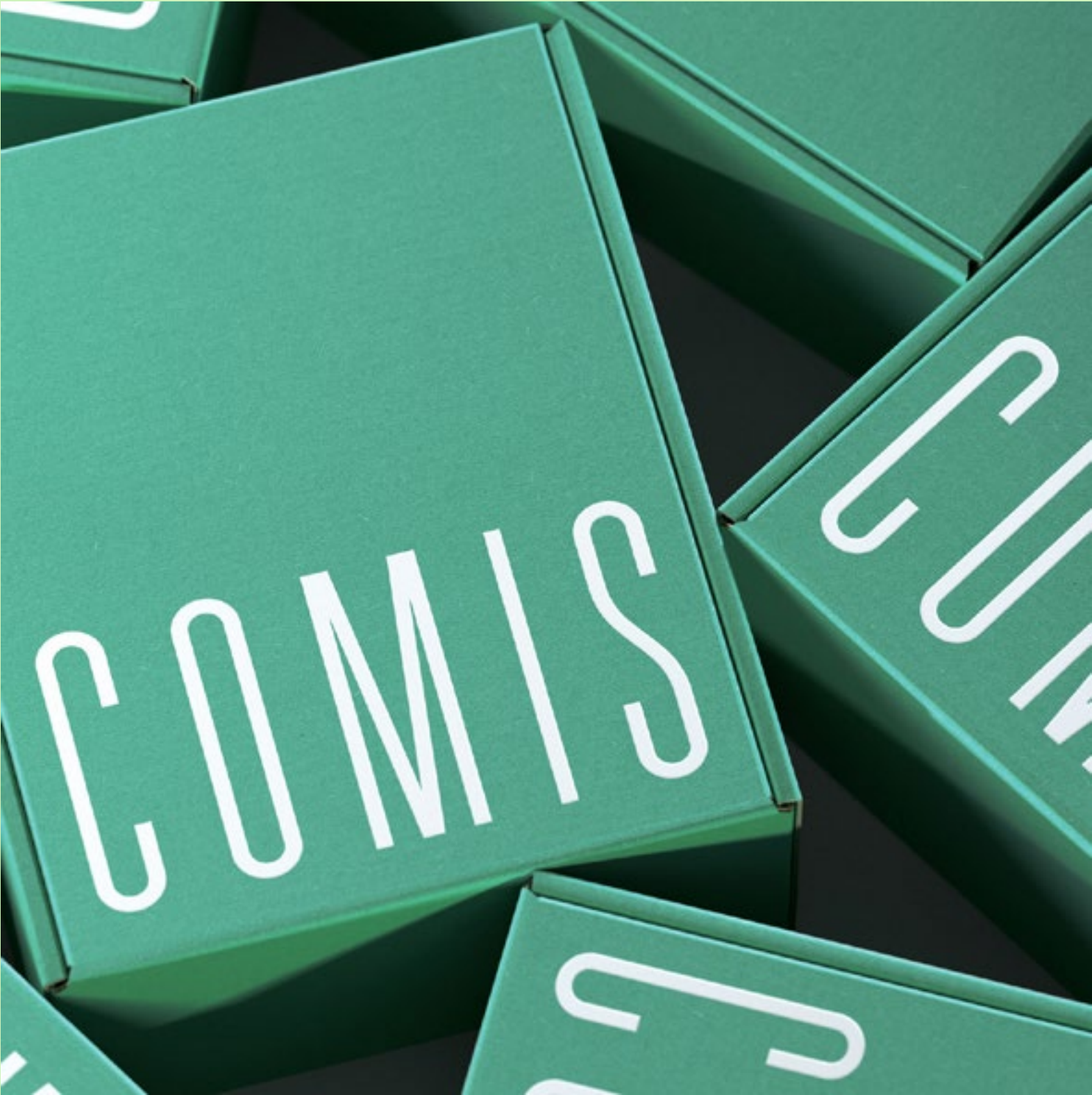
Identity and text details printed using water-based inks.